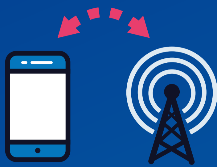
Distance to tower

Enjoy 5-bars of coverage with Celona's in-building private network solution.