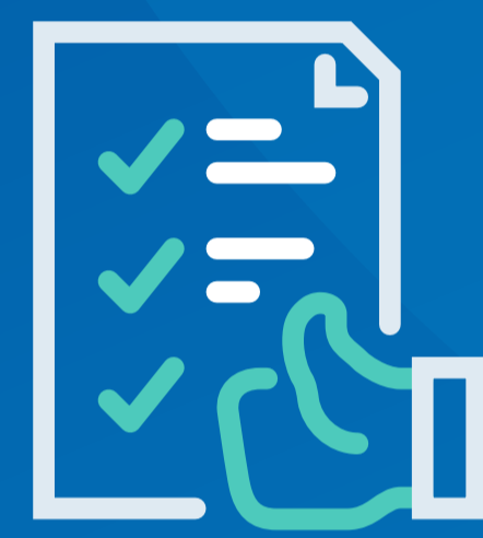
Efficient facilities management