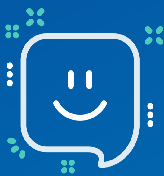
Better customer experience