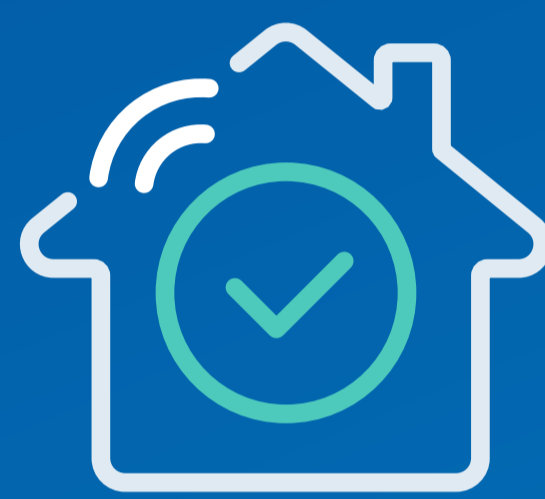
Higher tenant retention