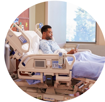
2. Patient / Visitor Experience