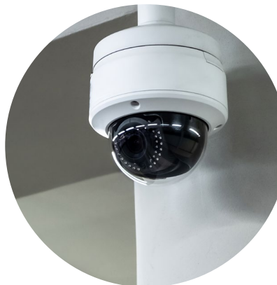
3. Secure IoT and Data