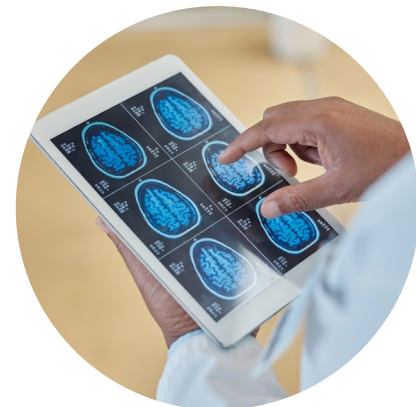
4. Extended Use Cases